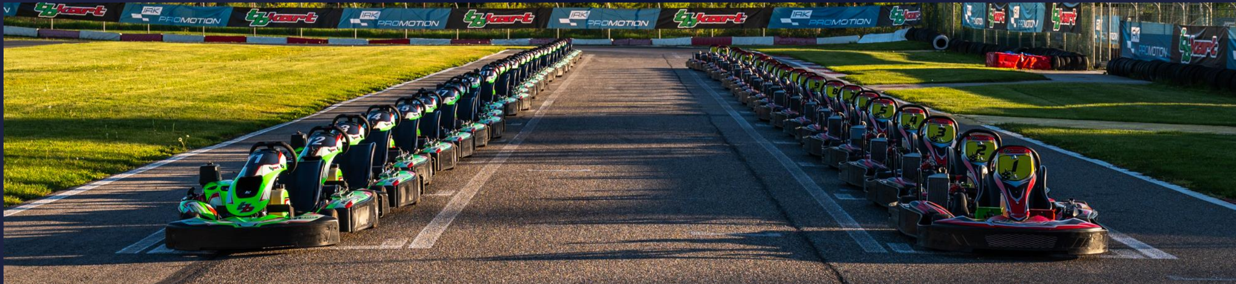
TBKART RONE 390cc 18hp ENDURANCE FINAL